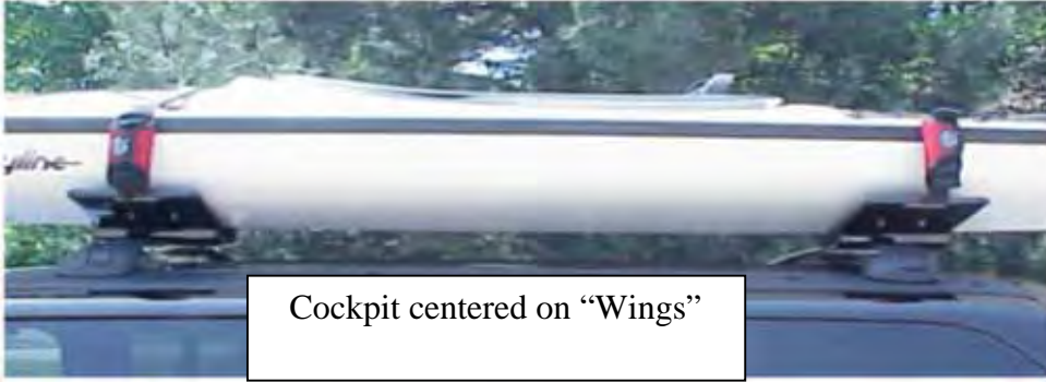
Cockpit centered on "Wings"